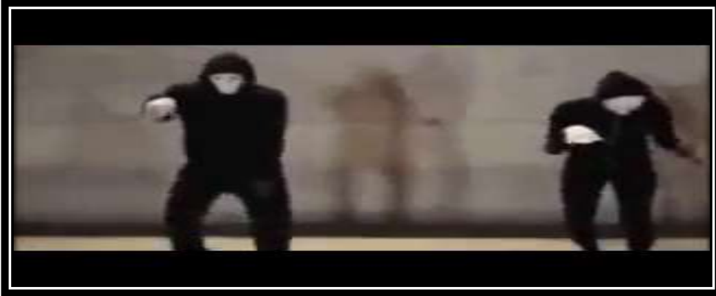
Figure 5. Azonto dance accompanying Wizkid music.