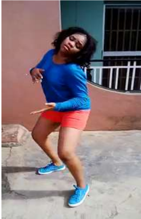
Figure 9. Shoki dance accompanying Dre San, Lil Kesh and Orezi music.