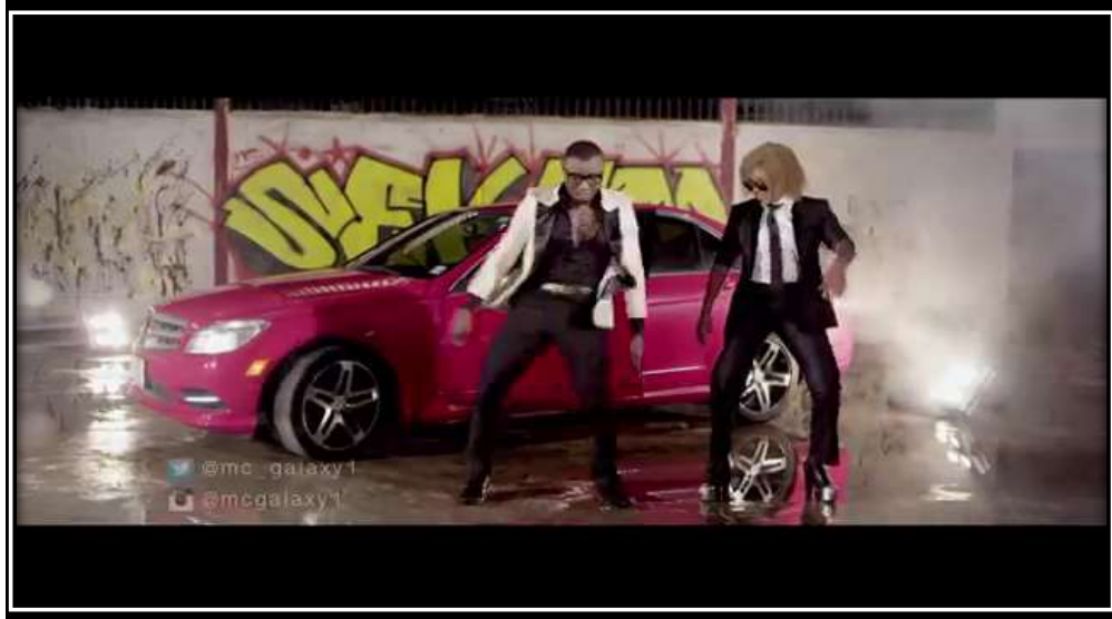
Figure 11. Sekem dance accompanying MC Galaxy music.