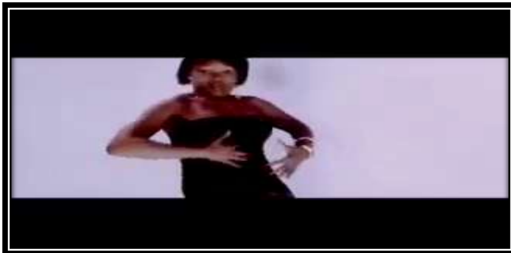
Figure 3. Alanta dance accompanying Artquake music.