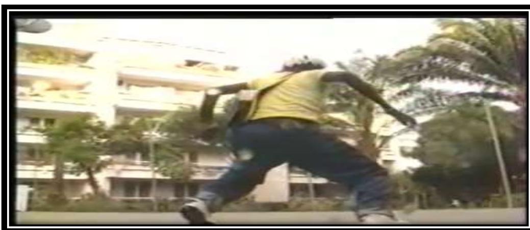
Figure 4. Makossa dance accompanying Olomide Awilo Longomba music.