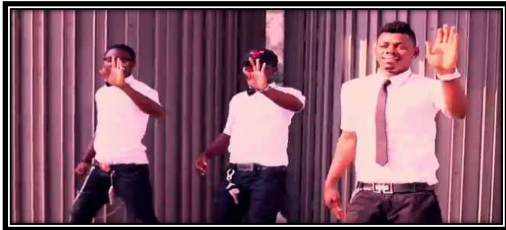
Figures 7. Skelewu dance accompanying Davido music.