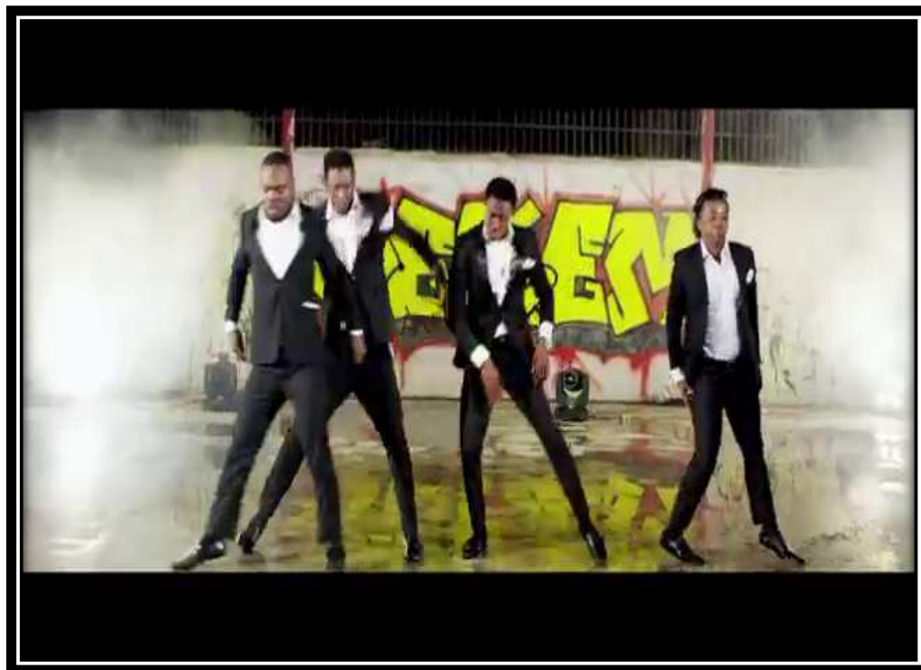
Figure 10. Sekem dance accompanying MC Galaxy music.