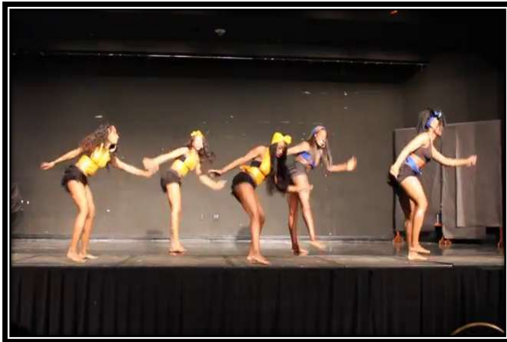
Figure 6. Etigi / Kukere dance accompanying Iyanya music.

modernised. Figure 6 expresses the dance step.