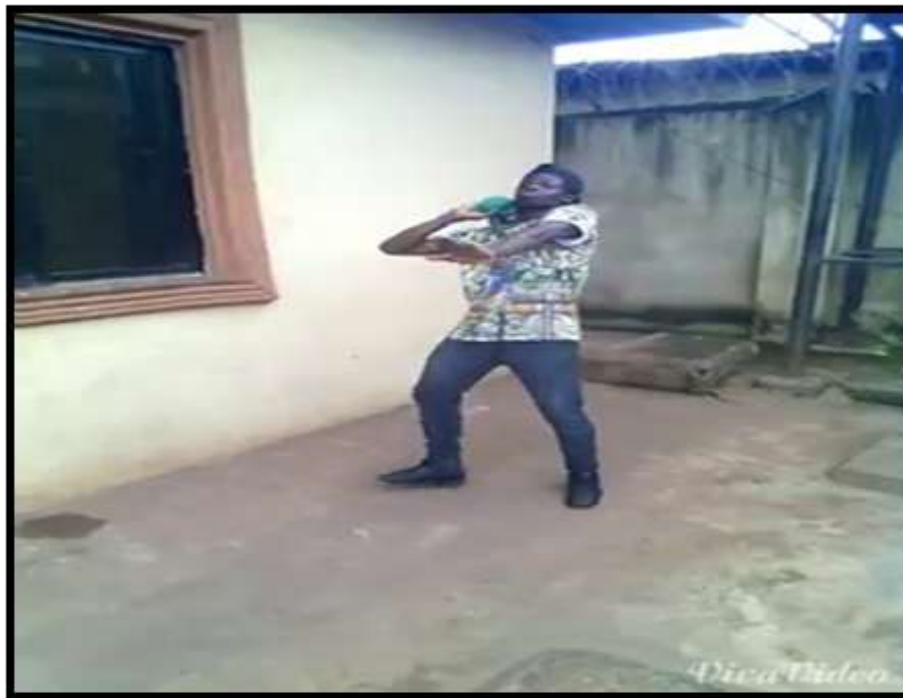
Figure 12. Shakiti Bobo dance accompanying Olamide music.

released, Olamide's Shakiti Bobo became a monster hit when its visuals were released with a trending dance step that many embraced with both arms. Shakiti Bobo became so famous that worshipers made its moves at churches across the federation. Figure 12 expresses the