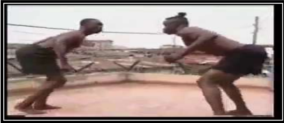
Figure 1. Galala dance accompanying Daddy Showkey music.