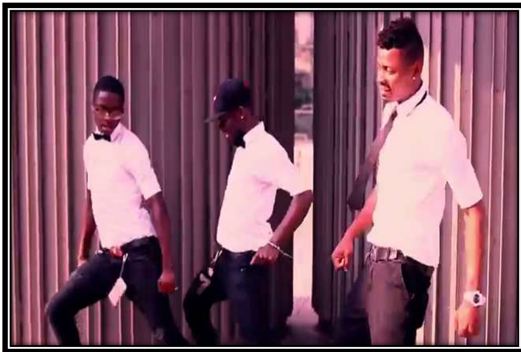
Figures 8. Skelewu dance accompanying Davido music.

Orezi. Leaving the originator issue behind, Shoki was a hit, considering how easy it is. Figure 9 expresses the dance step.